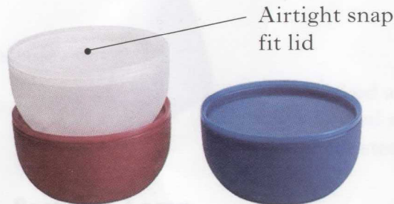
Injection moulded re-usable food containers