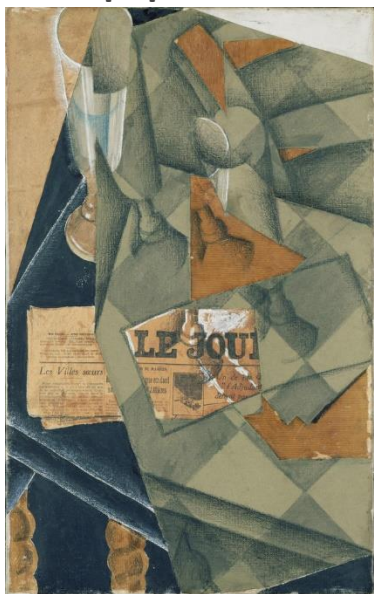
Figure 5 Juan Gris Glass and Newspaper 1914