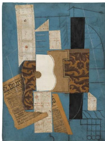
Figure 6 Picasso Guitar 1912