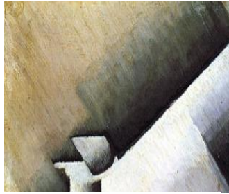
Figure 3 Gris close up