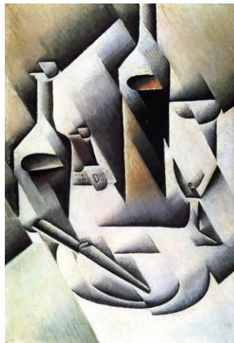
Figure 1 Bottle and Knife 1911