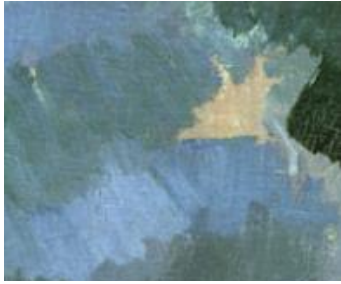
Figure 4 Cezanne close up